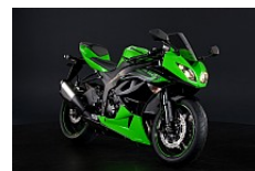
Lime Green / Ebony

World Supersport contender on track, magazine test favourite on road. Kawasaki invented the mid-weight class, feel free to enjoy the result of our experience and success.