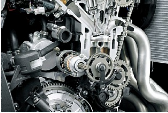
Strong mid-range power