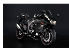
Ebony / Flat Ebony