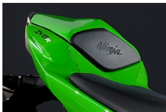
Pillion seat cover