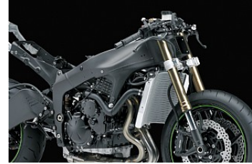
Mass centralisation and frame rigidity