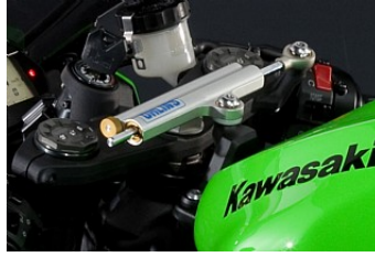
Race-quality steering damper