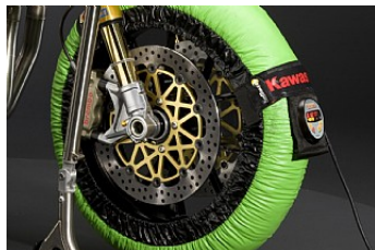
Tyre warmers "Integral"