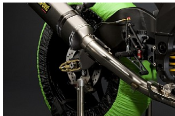
Tyre warmers "Advanced"

These parts are excluded from Kawasaki Warranty terms and conditions.