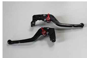
Adjustable lever set